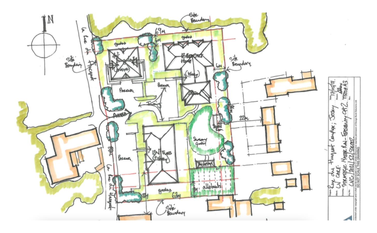
Appendix 4 – Community Care Complex Scheme drawing