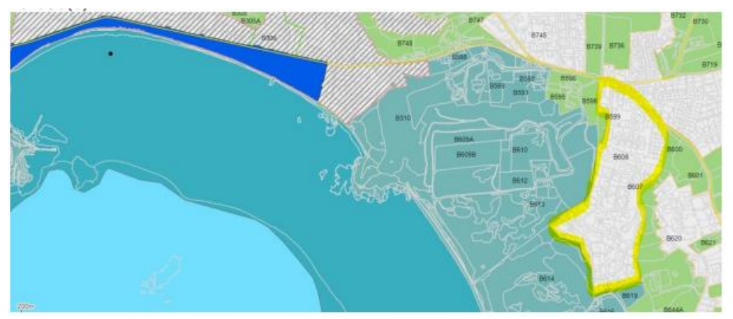
Figure 1 – Proposed extension to GBZ (highlighted in yellow)

On this basis, it is proposed to extend the spatial definition of the green backdrop zone, as highlighted in yellow, on the plan below.