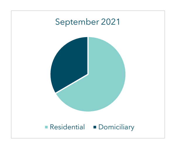
Exhibit 10: Residential and domiciliary care analysis (LTC Benefit) - September 2021 and 2019

45. Figures from September 2021 show that the majority of LTC Benefit cases (67%) and LTC Support cases (82%) are for people who live in residential care settings. In a number of cases, individuals are in receipt of both LTC Benefit and LTC Support payments. Exhibit 10 shows the analysis for September 2021 for LTC Benefit claimants only compared to September 2019. The shift to more domiciliary care provision in 2020 and 2021 reflects factors such as available capacity in the residential sector as well as constraints on admissions due to the impact of the COVID-19 pandemic in the period.