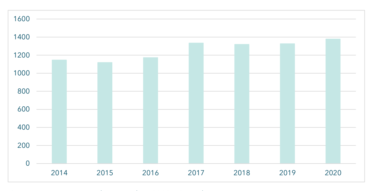
Exhibit 8: LTCS claim numbers at year end since 2014