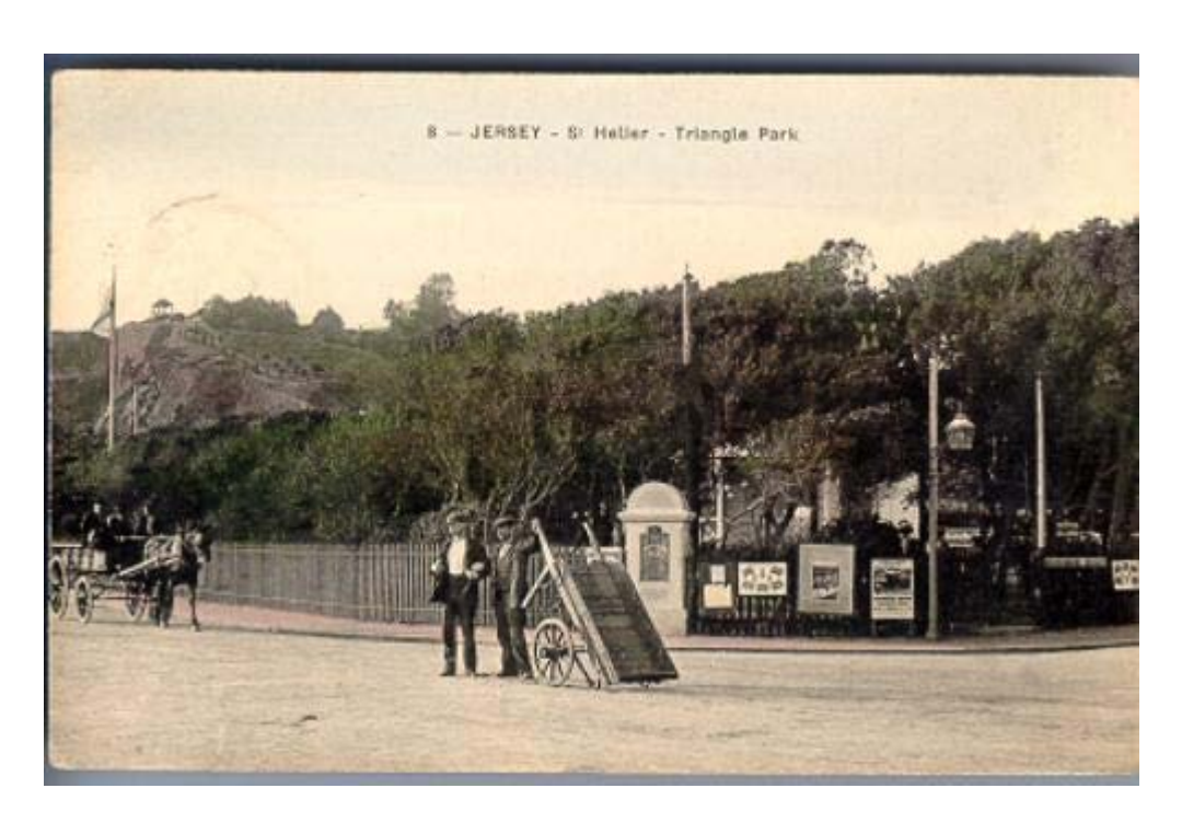
Triangle Park, Jersey

In 2013 Archive Staff told hundreds of Islanders the stories of L'Etacq, Gorey Village, Pier Road, St Mary's Village, Colomberie, Westmount, Green Island and Samarès, Noirmont and Portelet, St Peter's Valley and Clairvale, Clearview and Columbus Streets.