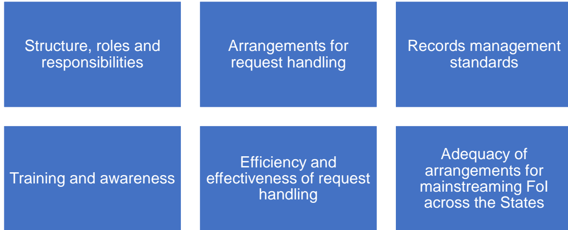
Exhibit 2: Focus of my work