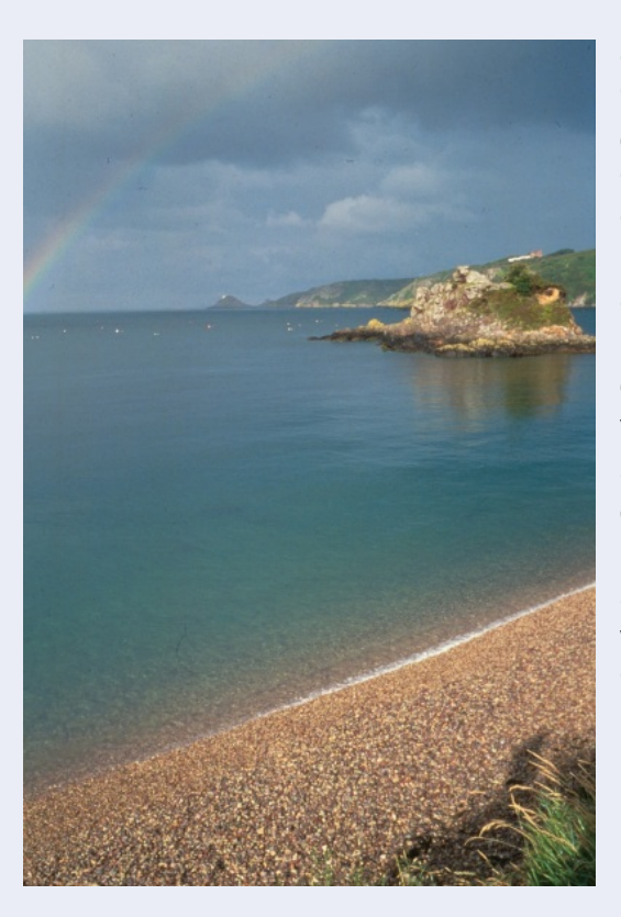
Figure 10 Coastal National Park