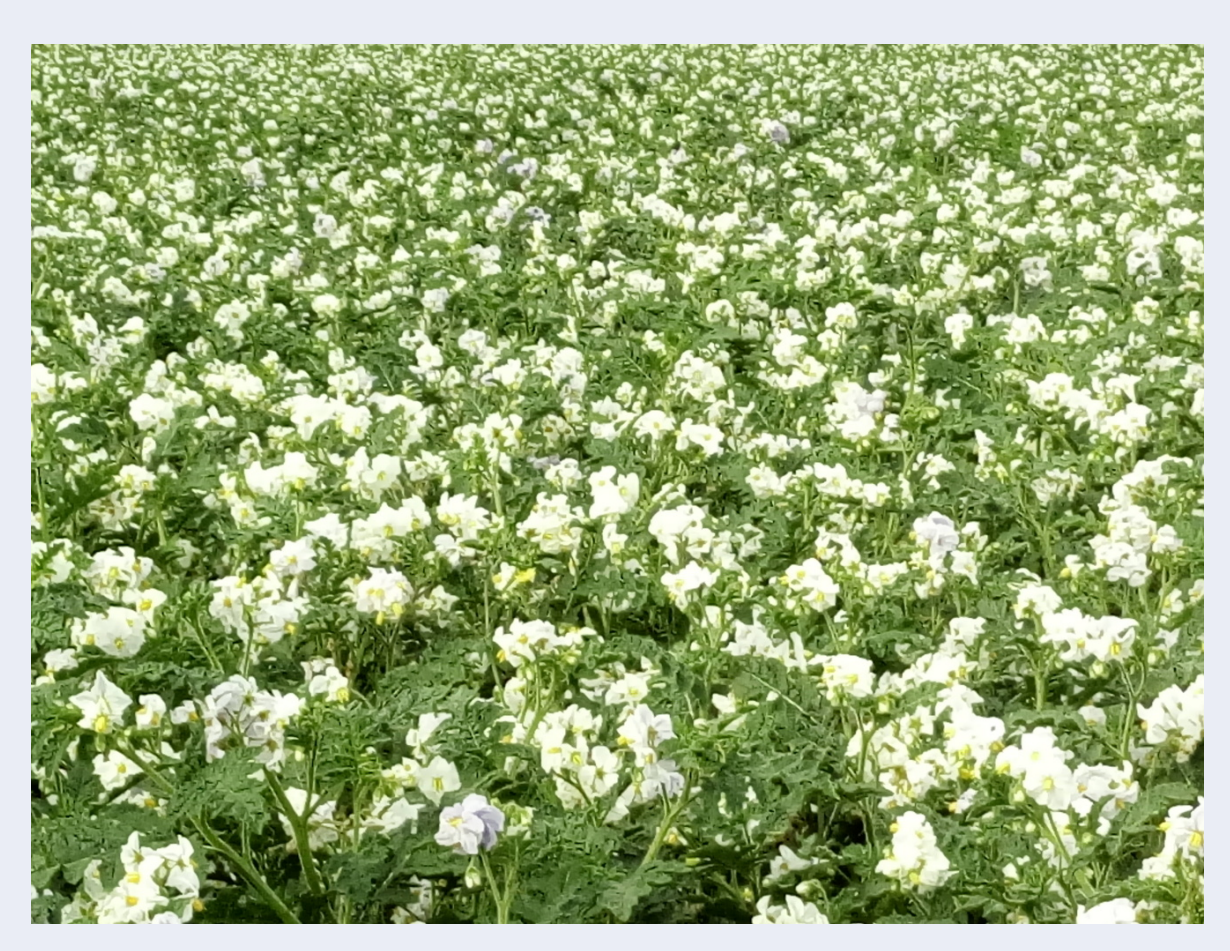
Figure 6 Research - Solanum sysimbriifolium was introduced to industry after Department of the Environment research