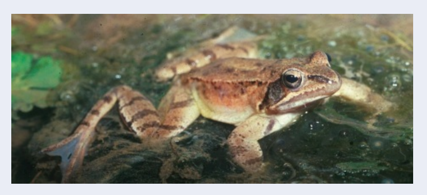
Figure 12 Jersey hosts the only population of the Agile Frog (Rana dalmatina) in the British Isles

4.18 Jersey has a responsibility to report its MEA progress via the UK to the Conference of the Parties and there is a need to survey to understand the condition of wild animals and habitats. Regular survey of aspects of our environment can be built into a monitoring programme which not only enables us to understand what is happening in our environment but also to report on our international responsibilities.