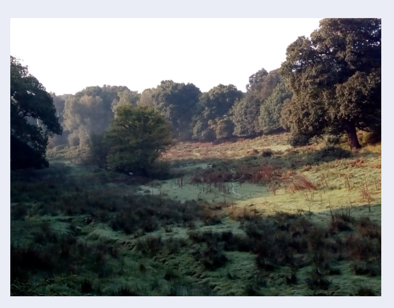
Figure 11 Our natural environment adds value and wellbeing