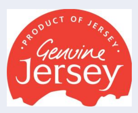
Figure 15 Genuine Jersey logo

well recognised brands and the expertise to protect and develop these brands should sit within JPPL rather than across a number of Departments. Consolidation within JPPL will improve cost effectiveness and operational efficiency.