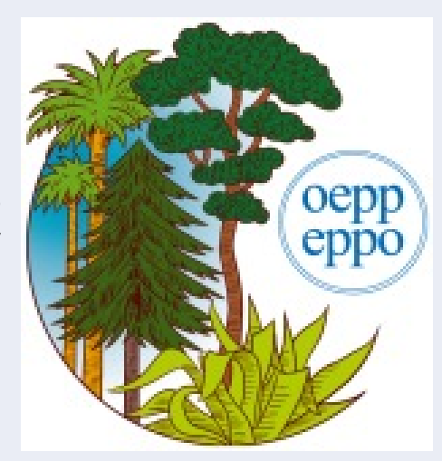
Figure 4 European Plant Protection Organisation logo

<u>Local History - See 'Appendix V: EPPO and Colorado Beetle Local History'</u>