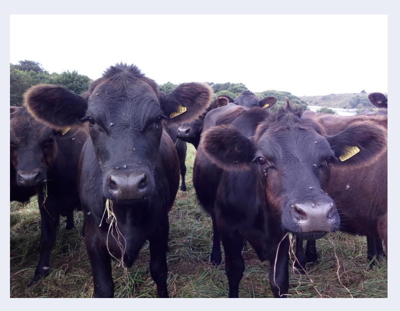
Figure 5 Beef cattle - Agricultural diversity is important

2.79 Maintaining a mixed farming economy: abattoir and animal by-products can be seen as essential infrastructure to maintain and further encourage an integrated system of arable livestock farming, with all that benefits this provides for sustainable land use and conservation. Jersey agriculture's economic output dominated by the Jersey Royal potato and by dairy farming. Integrating arable and livestock farming is increasingly recognised as a