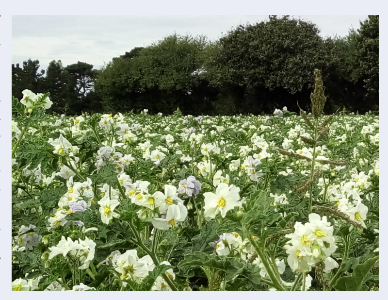
Figure 3 Potato Cyst Nematode: cultural control methods are very important