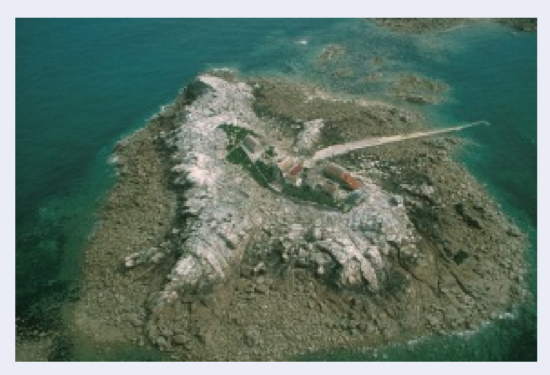
Figure 9 Offshore reefs are also given protection under the Coastal National Park