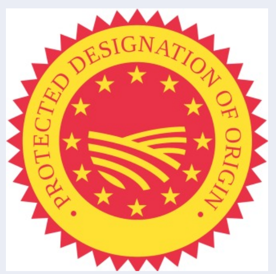
Figure 14 Protected Designation of Origin official logo

"First early grown for early production in Jersey. Produces yields of uniform long oval tubers. Medium - low dry matter. Firm cooked texture. Market - new season ware".