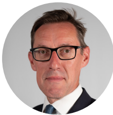
Deputy Ian Gorst