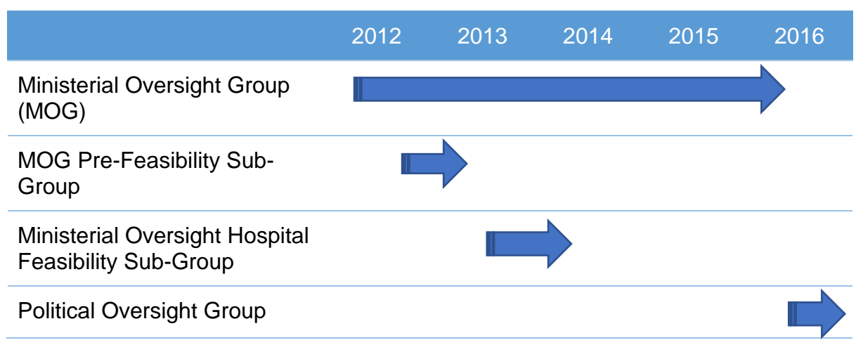
Exhibit 4: Ministerial arrangements for the Future Hospital 2012 – 2016