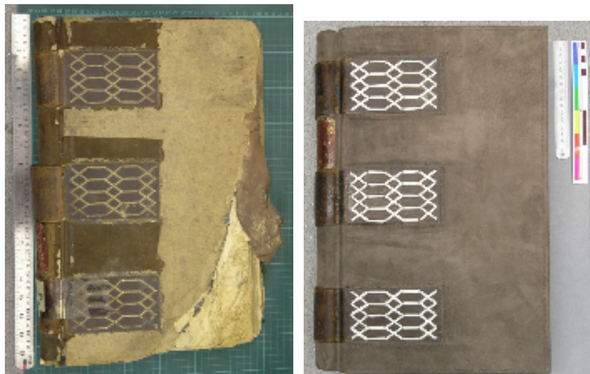
A/B/2 – Lieutenant Governor's Letter Book, 1816 – 1842 before and after treatment

Public records currently held at the Jersey Archive are kept in an environmentally controlled secure strongroom which is monitored for temperature and humidity by the Conservator on a daily basis. In 2011 the Conservator spent 233 hours ensuring that all public records arriving at the archive were cleaned and repackaged. The Conservator is also responsible for a programme of conservation of badly damaged items. In 2011 20 items were fully conserved using an external firm. The archive currently holds 531 items in an unusable condition that are in need of active conservation work and are currently unavailable to members of the public.