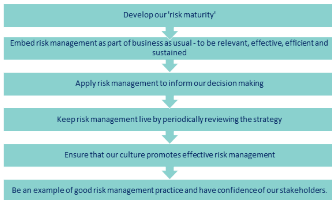
Exhibit 4: Risk Management Strategy 2022 - Objectives