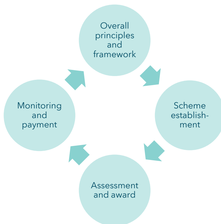
Exhibit 4: Elements of an effective grants and subsidies framework