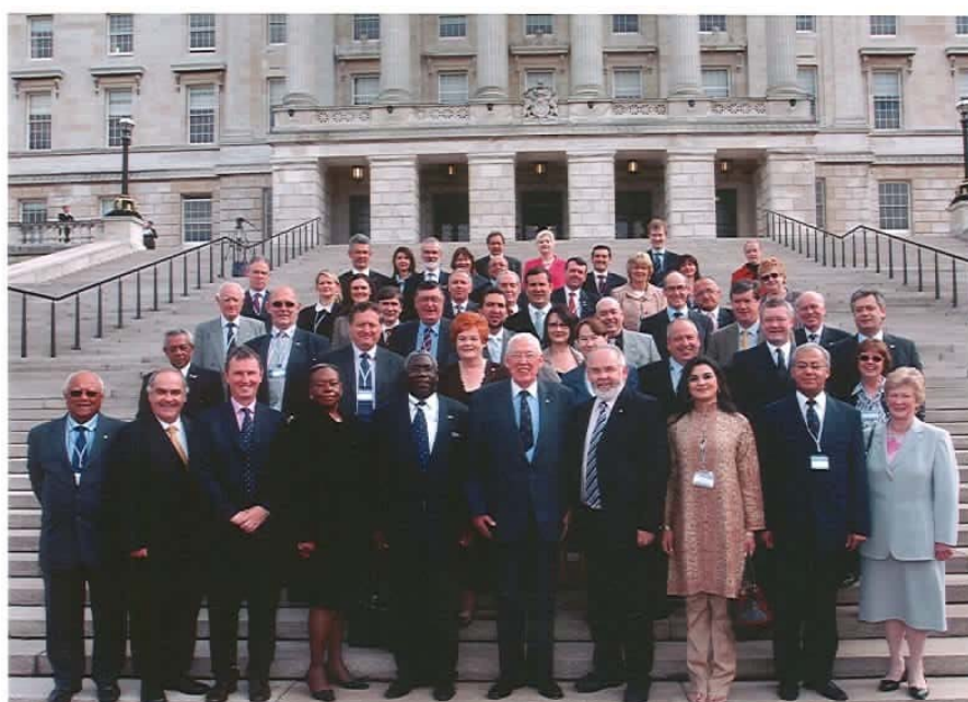
Delegates at the Regional Conference in Belfast with First Minister Rev Ian Paisley