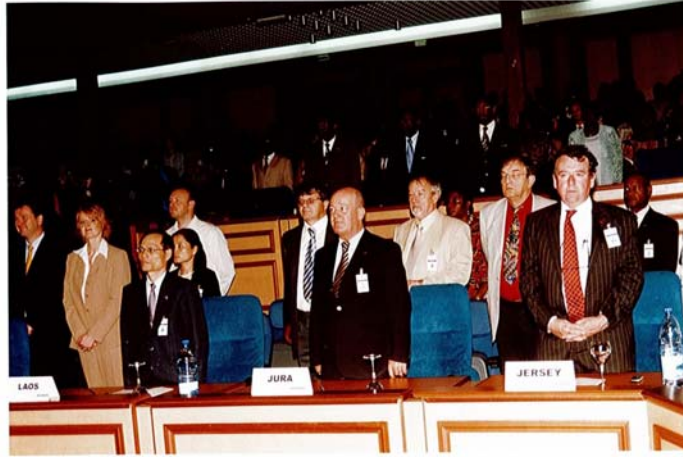
Deputy Power and other delegates at the XXXIII session of the APF in Libreville, Gabon