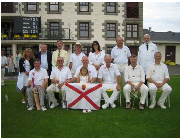
The Jersey team on 14th July 2007

After the match the participants were invited to a reception at Government House before the Guernsey visitors returned home.