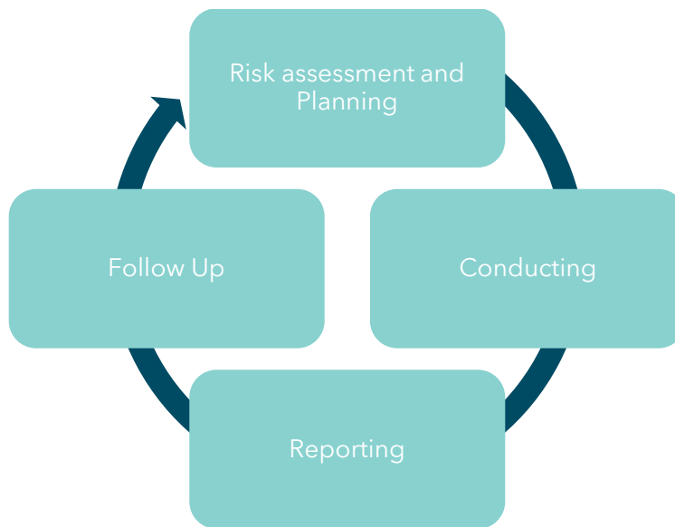
Exhibit 3: The Audit Cycle