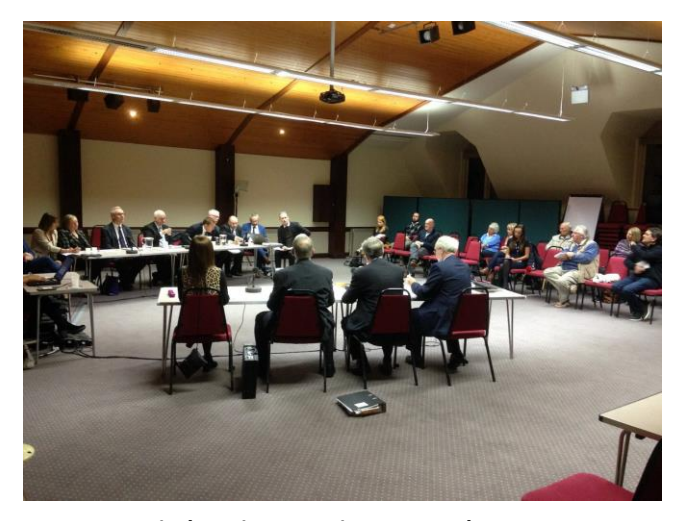
Future Hospital Review Hearing, November 2016

9. Review panels – Review panels are formed by the Chairmen's Committee to review a particular proposal, issue or project which may cut across the remit of a number of different scrutiny panels. We contributed to a number of review panels, including: Future Hospital Review Panel, Machinery of Government Review Panel and the Brexit Review Panel.