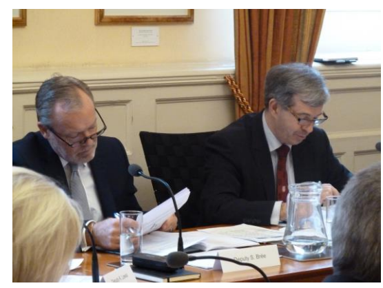
Public Hearing with the Chief Minister, February 2015

important background to their work. Advisers' reports were appended to the relevant final reports.